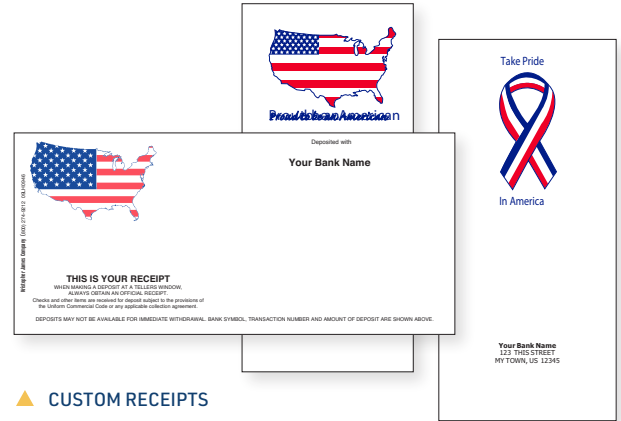
▲ CUSTOM RECEIPTS

HOLIDAY & SEASONAL: Envelopes, receipts, and checks