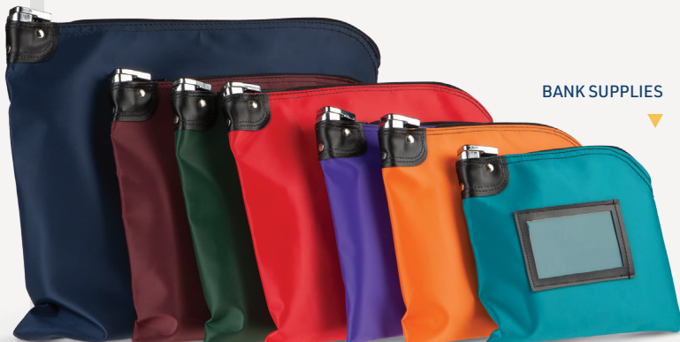
BANK SUPPLIES ▼

COMPLIANCE SUPPLIES: State & Federal Financial and Labor Law Posters and poster service subscriptions