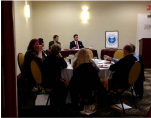
Attendees enjoying dinner and networking

Photographs from Our September 2014 Dinner Meeting at the Holiday Inn in Totowa, New Jersey on the topic of Legal Issues Associated With Special Needs Children