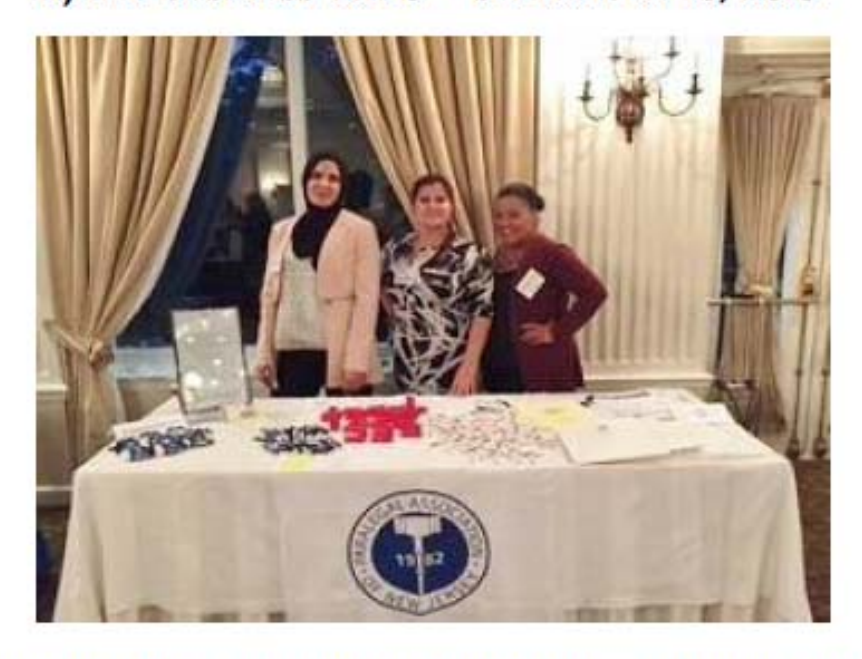
PANJ SEPTEMBER 2016 DINNER MEETING - MONTCLAIR STATE UNIVERSITY

NJALA BUSINESS EXPO - SEPTEMBER 13, 2016