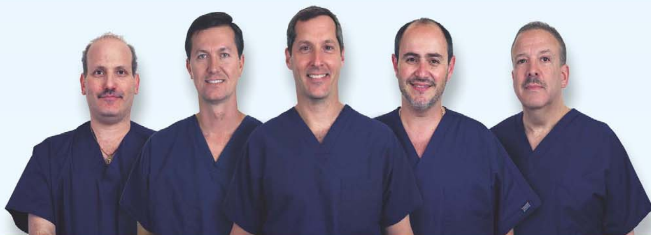
From Left to Right:

Providing the best treatment for neck and back pain