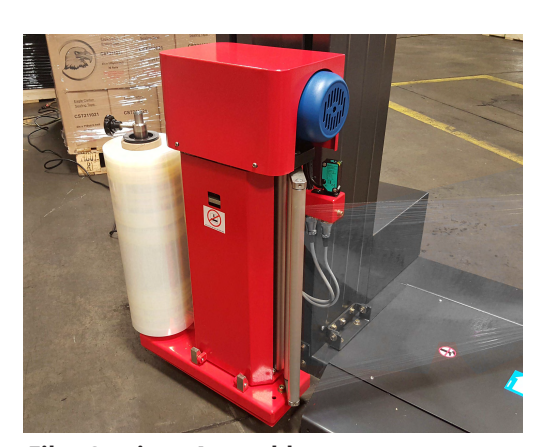
Film Carriage Assembly